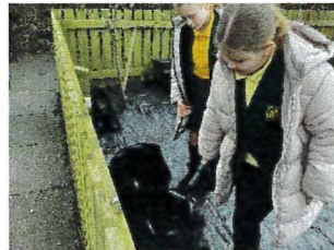
Planting potatoes and checking that they are happy