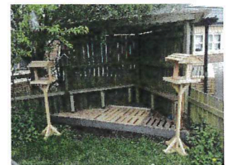
The outdoor hut, made from recycled pallets, has been a huge hit with our pupils. The seating area in the garden is now renovated so pupils can once again sit and enjoy the wonderful natural world around them. The birdsong here is incredible.