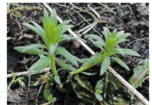
Meadow Cranesbill and Toadflax