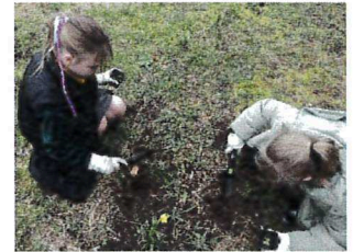
We had many helpful volunteers