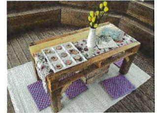
Our outdoor gazebo which has been magically transformed into an engaging reading area. Along with the hundreds of new fabulous books we have just received at our school, reading is becoming even more of an amazing experience at Burlington Juniors.