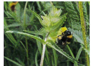
Our Yellow Rattle and the visitors it regularly attracted

This year we added some more species we had grown from seed, or transplanted from the garden area: Yarrow, Ox-Eye Daisy; Knapweed, Toadflax and Meadow Cranesbill.